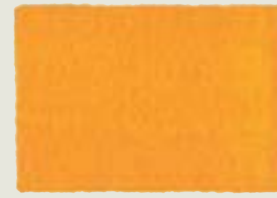
Gamboge 105, PY 151 & PO 62, LF I, SO