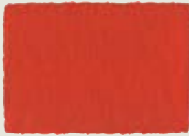
Naphthol Red 120, PR 112, LF II, SO