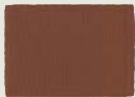
Burnt Sienna 020, PB 7*, LF I, O