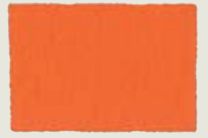
Cadmium Orange 038, PO 20, LF I, O