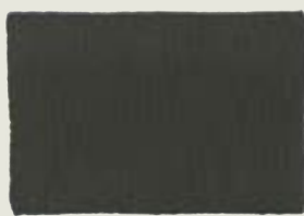
Lamp Black 112, PBk 6, LF I, O