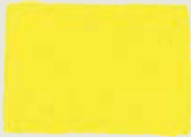
Cadmium Yellow Light 070, PY 35, LF I, O