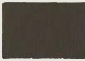
Dioxazine Purple 100, PV 23, LF II, O