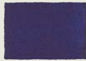
Phthalocyanine Blue 140, PB 15:3, LF I, O