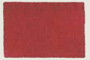
Quinacridone Rose 156, PV 19, LF I, ST