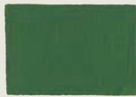
Permanent Green Light 130, PG 7 & PY 151, LF I, O