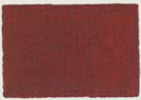
Alizarin Crimson 010, PR 83, LF III, ST