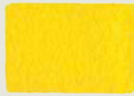
Cadmium Yellow 060, PY 35, LF I, O