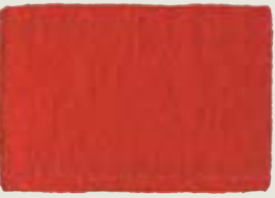
Pyrrol Red 154, PR 254 & PR 209, LF I, SO