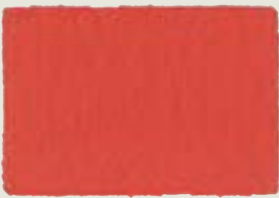
Cadmium Red Light 050, PR 108, LF I, O