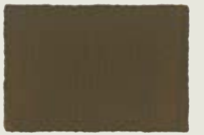
Raw Umber 170, PB 7, LF I, O