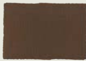
Burnt Umber 030, PB 7*, LF I, O