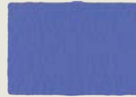
Cobalt Blue 090, PB 28, LF I, O