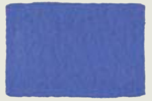
Cerulean Blue 080, PB 36, LF I, O