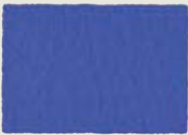
Ultramarine Blue 190, PB 29, LF I, O