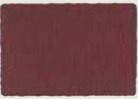
Quinacridone Violet 158, PV 19, LF I, SO