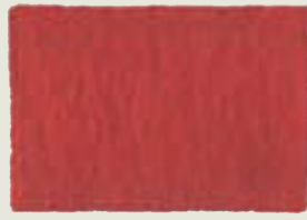
Quinacridone Red 155, PR 209, LF I, T