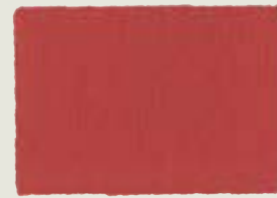
Cadmium Red 040, PR 108, LF I, O