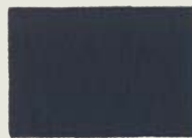
Paynes Gray 128, PBk 9 & PB 29, LF I, O