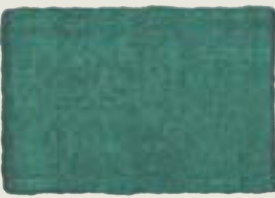
Viridian 195, PG 18, LF I, T