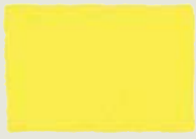
Hansa Yellow 107, PY 3, LF II, SO

EVERY ARTIST DESERVES THE FINEST COLOR THAT CAN BE CREATED