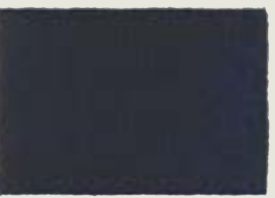
Prussian Blue 153, PB 27, LF I, SO