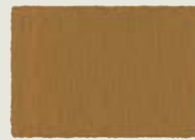
Raw Sienna 160, PB 7, LF I, O