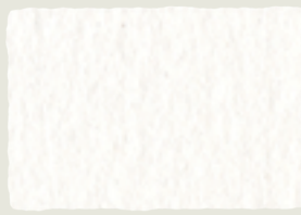
Titanium White 180, PW 6, LF I, O