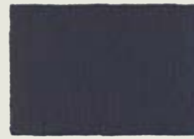
Phthalocyanine Green 150, PG 7, LF I, SO