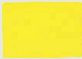
Azo Yellow 018, PY 151, LF I, SO