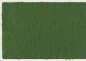
Sap Green Permanent 174, PG 7 & PY 110, LF I, O